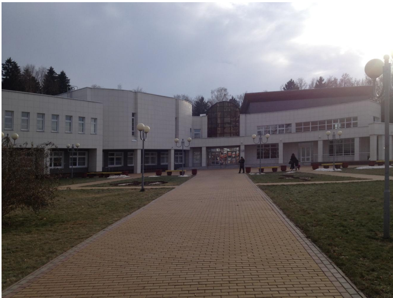
Art School for Children Moscow, Troitsk, October pr. 12.